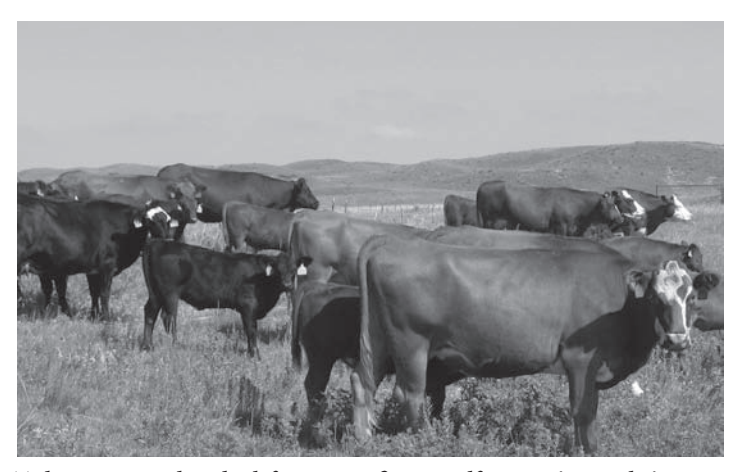
Today many ranchers look for ways to fit cow-calf enterprises to their production and market environments.

My involvement in major educational projects included directing the Nebraska Range Youth Camp for 10 years from 1979 to 1989, serving on the planning and teaching team for the biannual Nebraska Range Shortcourse, in even numbered years, from 1978 to 2006, and co-founding and teaching the Nebraska Ranch Practi-