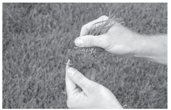
A tour participant takes a close look at the grass on an athletic field at Burwell High School.