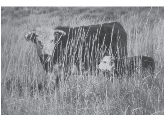
Three decades ago it was common to calve several months before green grass was available.

After drought in the 1980s, we published "Drought Management on Range and Pastureland: