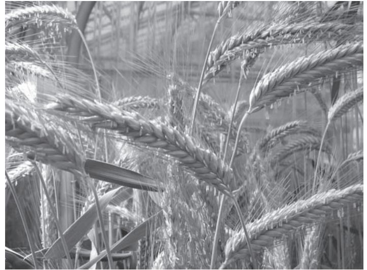
Triticale heads in the greenhouse. Triticale is planted and harvested like most small grains and is closest in appearance to winter wheat.

We had three experiments to address our objectives. The first two experiments consisted of 26 experimental triticale strains, three released triticale cultivars and one wheat cultivar, for comparison (winter wheat is the primary winter cereal grown in the U.S.). These two experiments were to assess the strains for both forage yield and quality, and grain yield. The two experiments were necessary because measurement of forage yield and quality is a destructive procedure, so we needed a second experiment to assess grain yield at maturity. In the third experiment we used