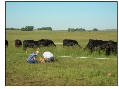
Figure 2. Clipping standing plant biomass immediately after grazing.

Research was conducted from 2013 through 2016 on a subirrigated meadow at the University of Nebraska-Lincoln Barta Brothers Ranch in the eastern Sandhills. Steers were rotated through pastures of two different grazing systems during the growing season (Figure 1). Immediately before and after the steers were moved to a new pasture, sample locations within the pastures were clipped at ground level, the clipped vegetation dried and weighed, and disappearance (intake) calculated (Figure 2). The difference in standing live vegetation biomass between the before and after clipping was considered intake.