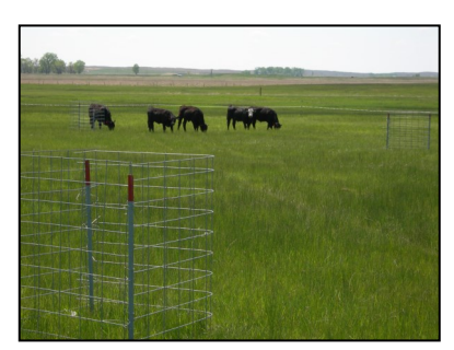
Figure 1. Steers grazing pastures on the subirrigated meadow at the Barta Brothers Ranch.

A principal objective of research to be conducted as part of IANR's Beef Systems Initiative is to optimize grazing efficiency of cattle on perennial grasslands, such as the Nebraska Sandhills. The research itself and the application of results rely on accurate estimation of forage intake of grazing cattle during the growing season. Daily forage intake of beef cattle on grazing lands can be variable depending on management, animal, and ecological factors and is difficult to estimate.