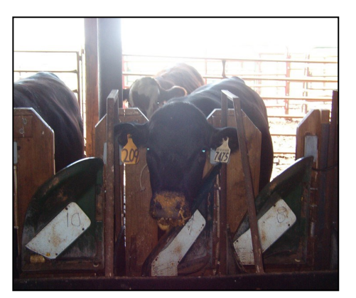
Pasture-grazed yearlings are gathered to receive individual supplements.

Data were collected from 10 previous studies that were published in the Nebraska