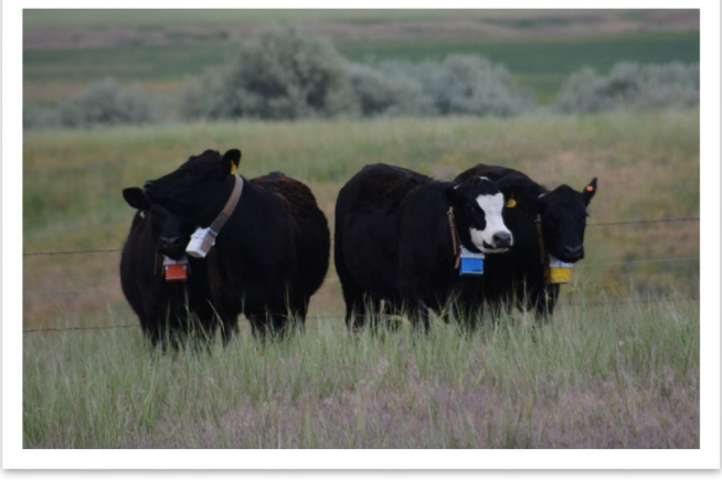
Figure 2. Cattle fitted with GPS collars in a study evaluating how cattle utilize the invasive annual grass cheatgrass ( Bromus tectorum ) in western Nebraska. With GPS-tracking, we can measure the amount of time cattle select to graze in cheatgrass compared to native perennial grass patches early in the growing season.

There are also other Precision Ag technologies that can provide producers new ways to evaluate animal health on rangelands with ear tags. Just like a FitBit® or an iWatch® can monitor the number of steps and other health measures, these ear tags can take estimates of the amount of time an animal spends grazing or resting and develop algorithms to assess the health of an individual animal. With this technology producers can identify individual sickness, heat detection, and parturition. For example, cattle that are beginning to calve will often express atypical grazing behaviors. When these behaviors present themselves, information can be sent directly to a producer's phone with specific information on the individual cow that is having a calf.