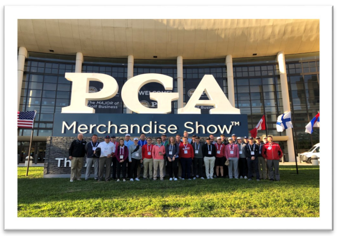
PGA Golf Management students and faculty at the 2020 PGA Merchandise Show in Orlando, FL.

Students engaged in interactions with numerous vendors learning about the latest and greatest in the golf industry from club manufacturers, technology companies, clothing/apparel companies, travel companies, and others. Many students interviewed with the countless PGA professionals looking to secure interns or full-time employees for the coming season and several walked away with multiple job offers in-hand.