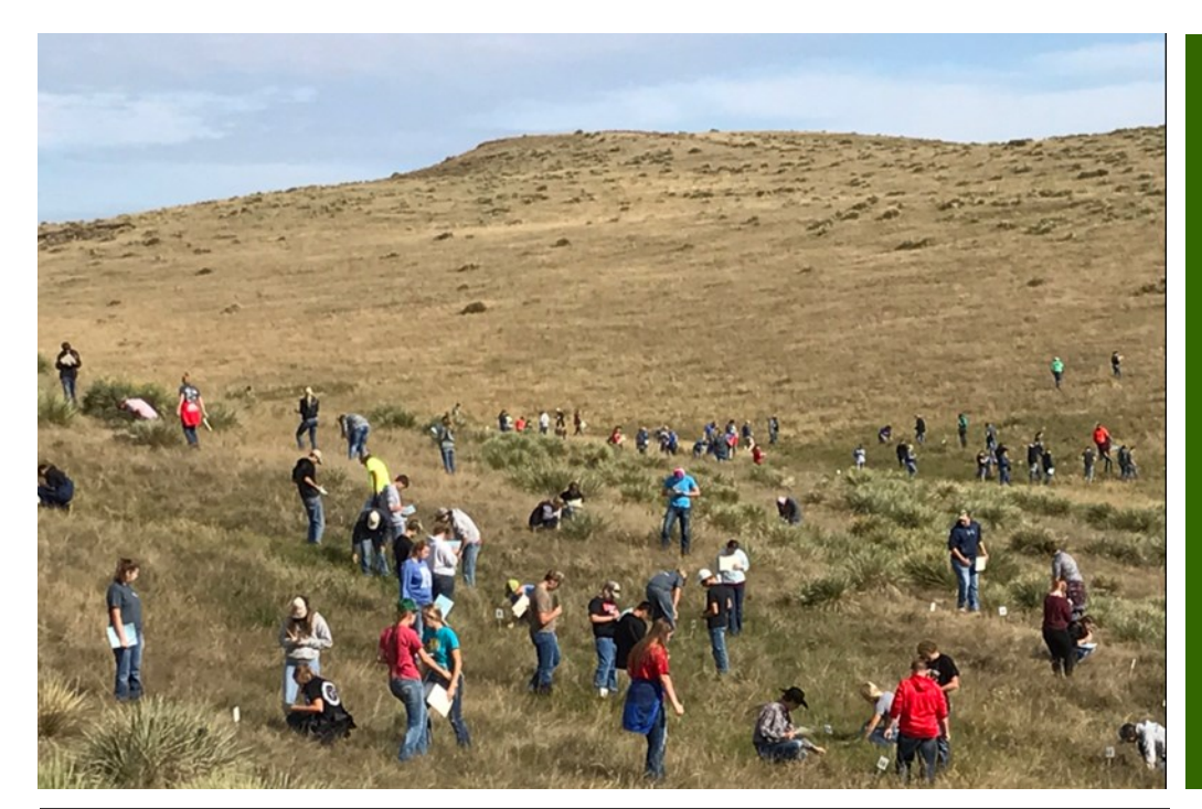
Grazing Livestock Systems | PGA Golf Management | I Integrated Beef Systems | Grassland Ecology and Management