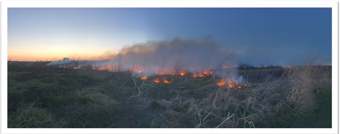
Prescribed burn near Bennet, NE.

Prescribed burning is more than just a tool to manipulate the prairie. It is an ecological process that is required for a healthy ecosystem. Prairie plants and animals evolved with periodic wildfires that raced across the countryside. Suppression of dangerous wildfires has left a gap in nature that cannot be replaced by any other process. In Nebraska, this gap or change in nature is usually seen as a shift in the types of plants that grow on a particular piece of land. Woody species, such as eastern redcedar, are stunted or completely killed by fire. Without fire on the landscape, these and other species may out-compete our preferred plant species, often to the detriment of wildlife and reducing economic benefits from grazing or haying.